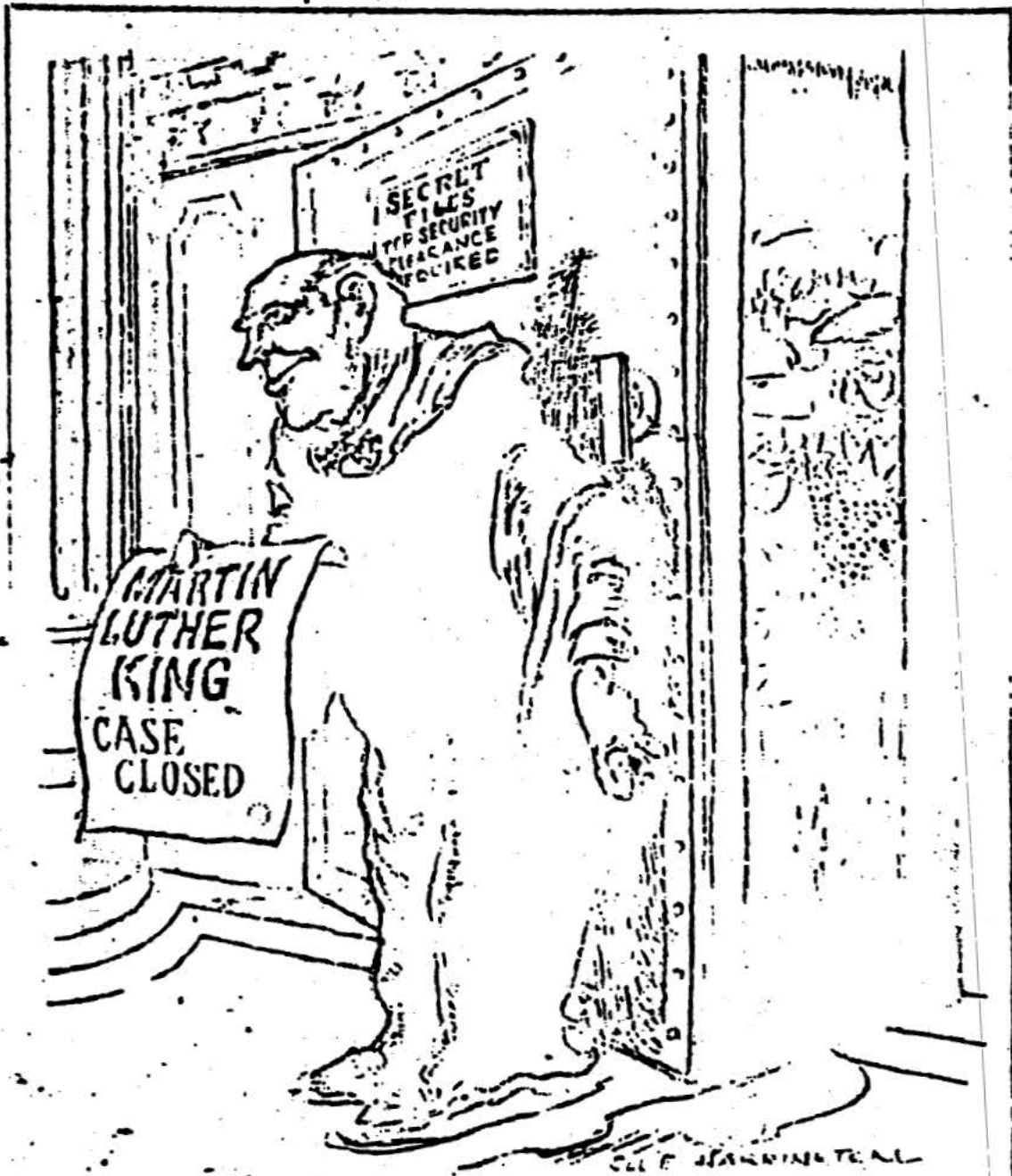
"And the confessed murderer, Mr. James Earl Ray, shall retain the right to publish his life story for $1,000,000— plus screen rights, of course — upon his eventual release!"